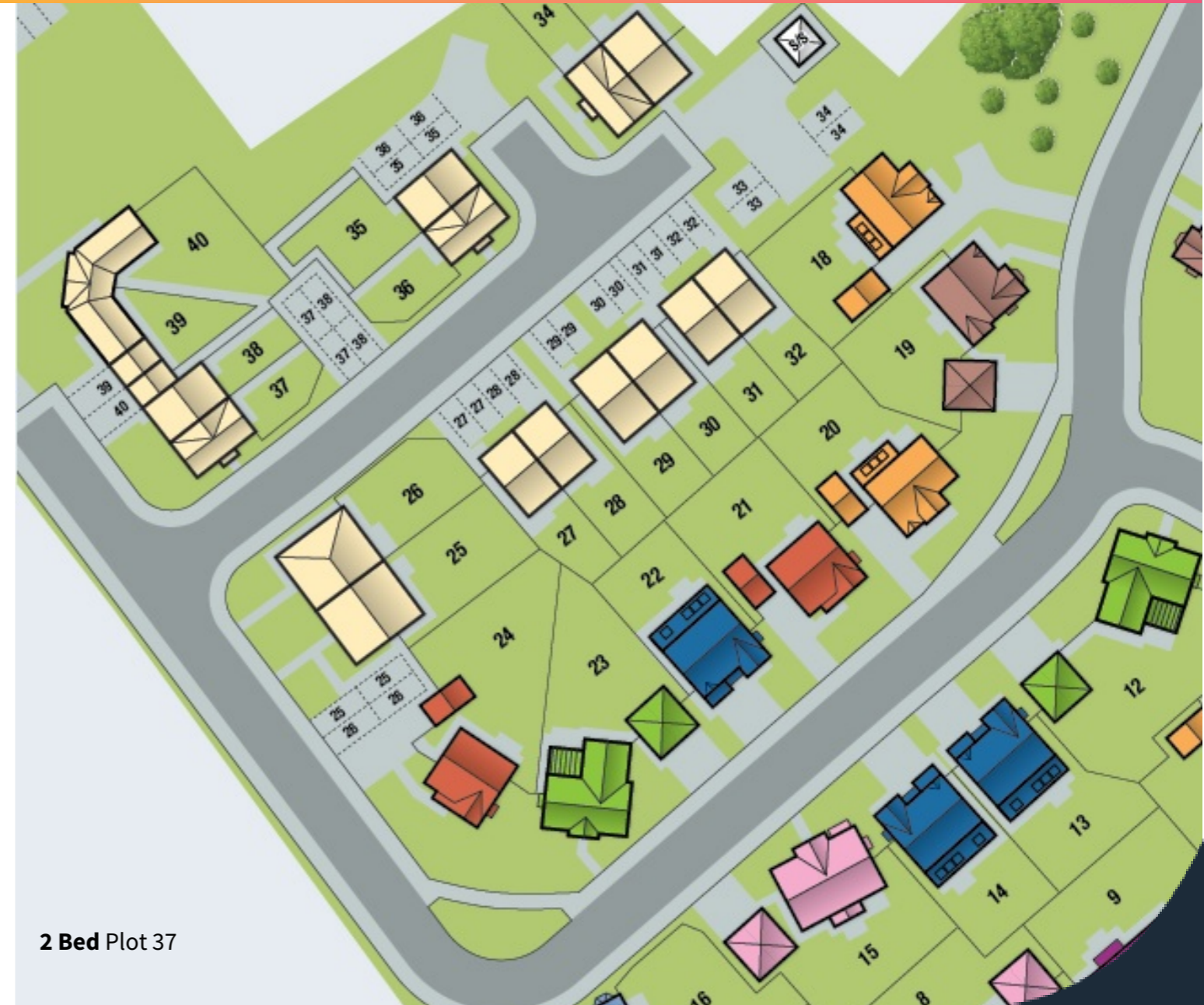
2 Bed Plot 37